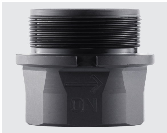
DEAD AIR XENO