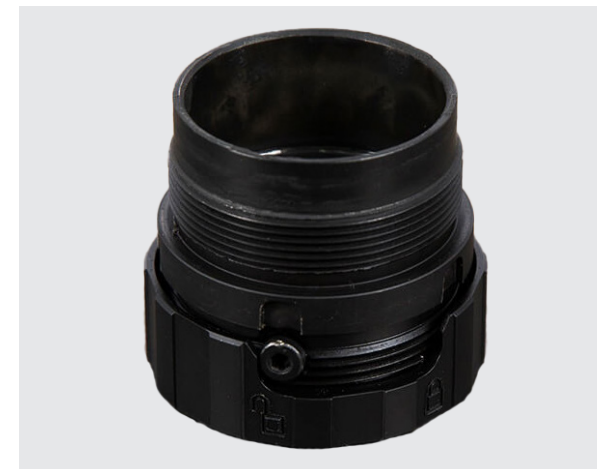
SILENCERCO ASR BRAVO