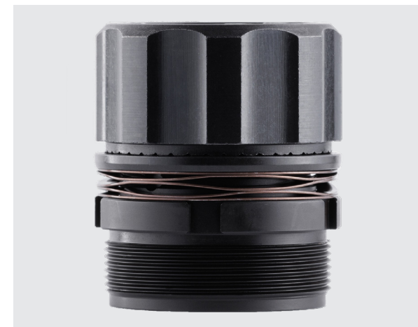
DEAD AIR KEYMO