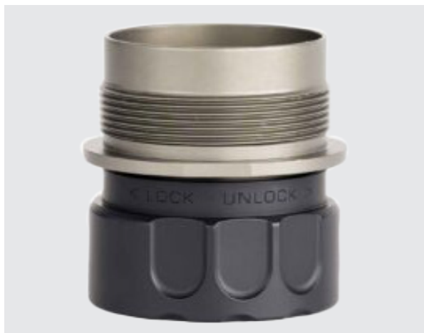
RUGGED UNIVERSAL MOUNT (RUM)